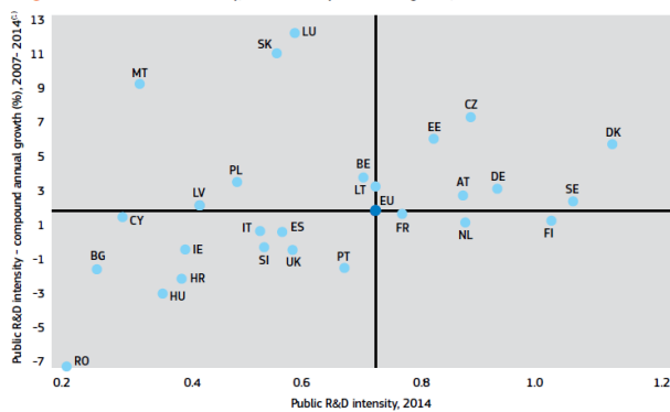
► Figure I-2-6 Public R&D intensity, 2014 and compound annual growth, 2007-2014

Source: DG Research and Innovation - Unit for the Analysis and Monitoring of National Research Policies Data: Eurostat Notes: 1) PT: 2008-2013. 2) EL: Greece is not included on the graph because valid data are available only for 2011-2014.